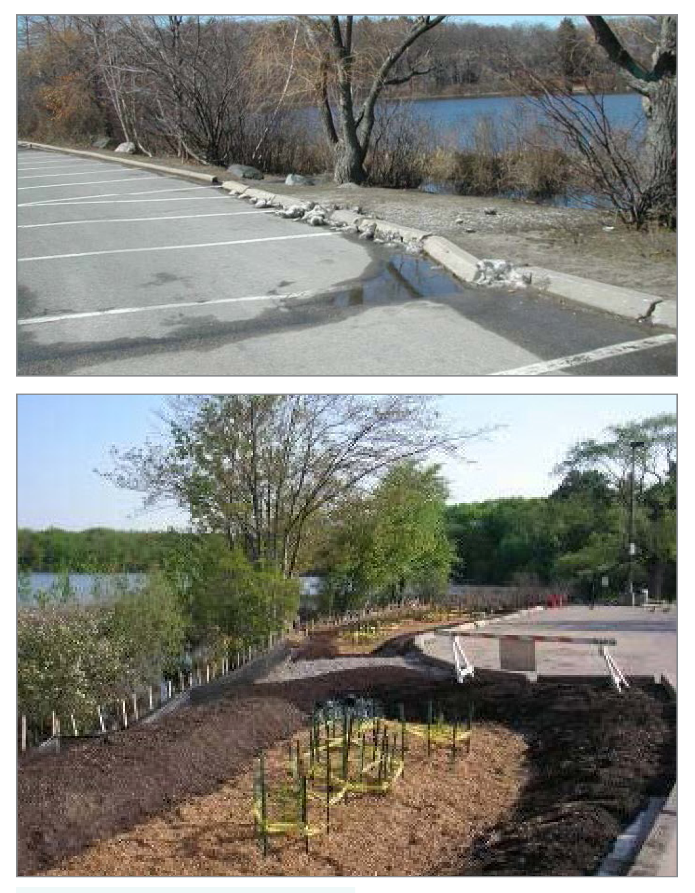
Figure 6-2: Adding a bioswale at edge of a parking lot