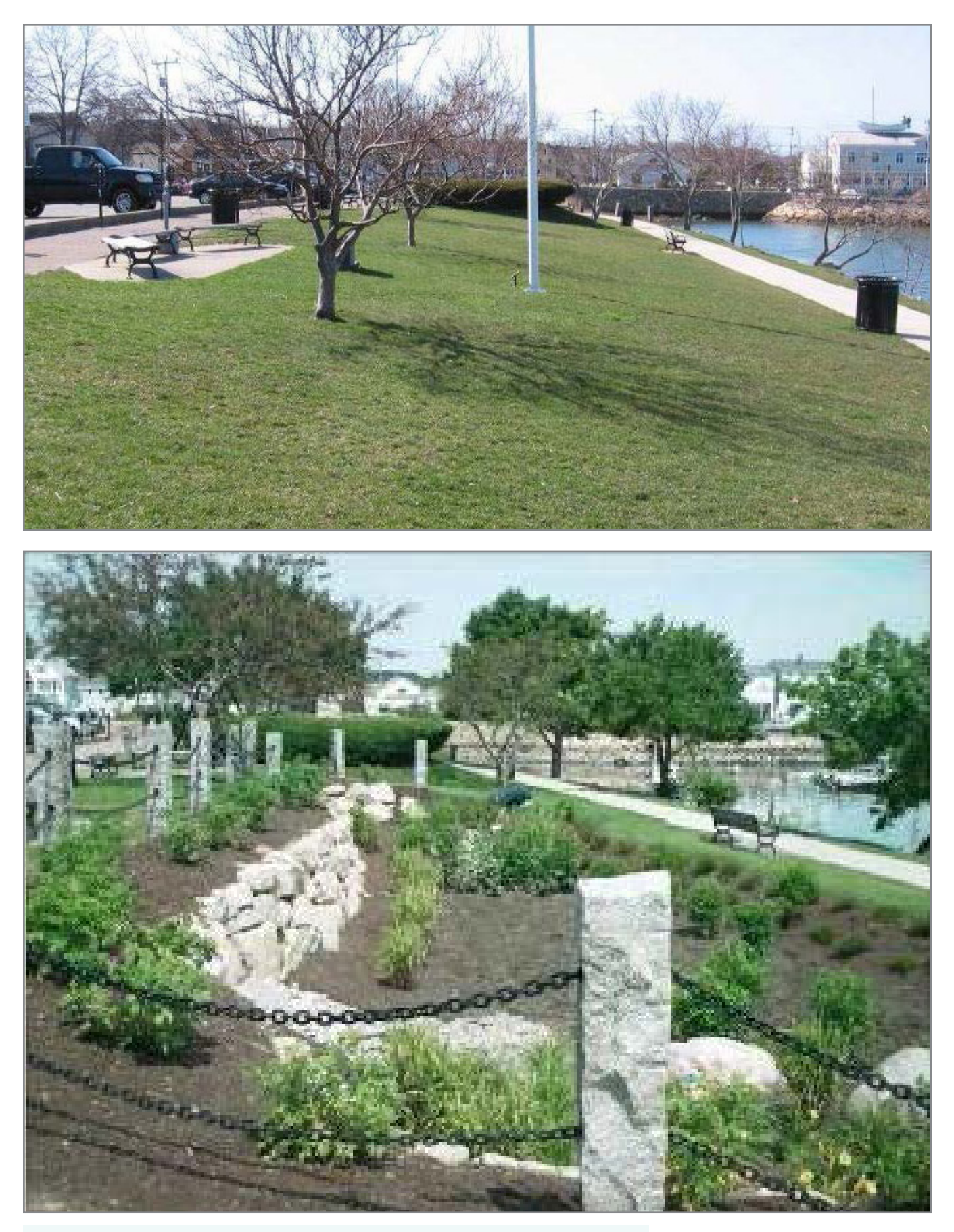
Figure 6-1: Adding a Bioretention basin (rain garden) in a municipal park