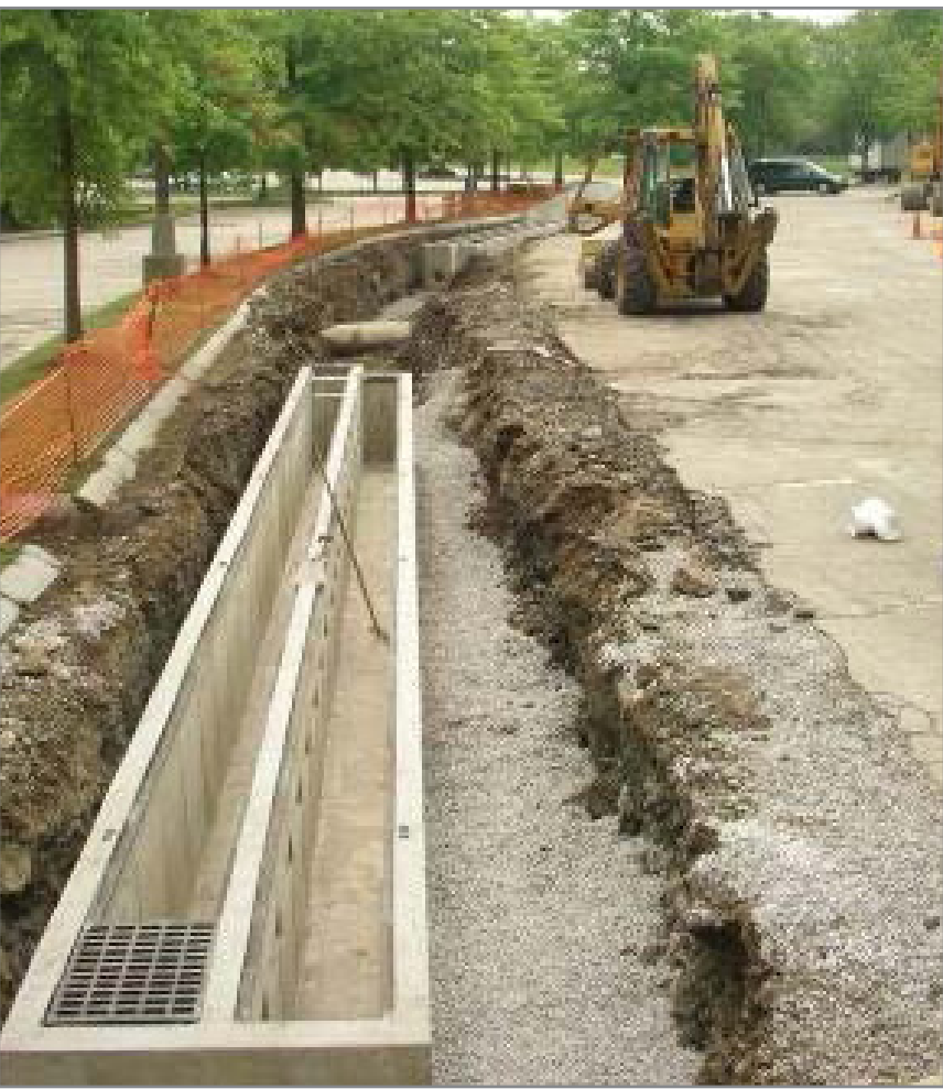
Figure 6-3: Adding a sand filter to treat parking lot runoff