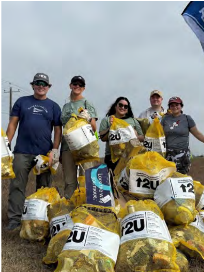
Volunteers at Packery Flats Winter Cleanup in Corpus Christi.