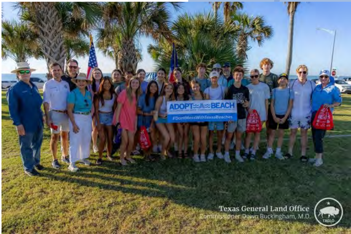
2024 Fall Cleanup volunteers with Commissioner Buckingham in Galveston.