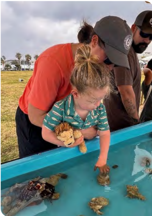
Touch tanks are a great way for kids to experience coastal critters!

The GLO will also be hosting the Adopt-A-Beach Spring Cleanup at two locations on South Padre Island that morning. You can plan to participate in the cleanup in the morning, then head over to the Roundup afterwards! Cleanup check-in locations are listed in this newsletter. Bring your friends and family and learn more about how the GLO and our partners care for and protect our beautiful Texas coast.