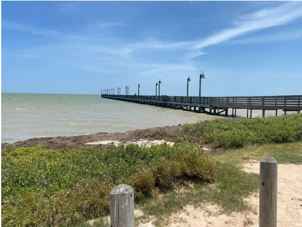
Current conditions of Fred Stone Park, with the pier completed in previous project phases

The current phase under this project included creating final design plans for an ADA restroom facility with a rinse station, roadway reconstruction, parking lot with ADA parking spaces, ADA compliant nature trail, appropriate safety lighting, and waste receptacles. In making these improvements, the Subrecipient hopes to provide safe public access and attract more people to the park and is currently securing funding for the construction of the park improvements designed in this project.