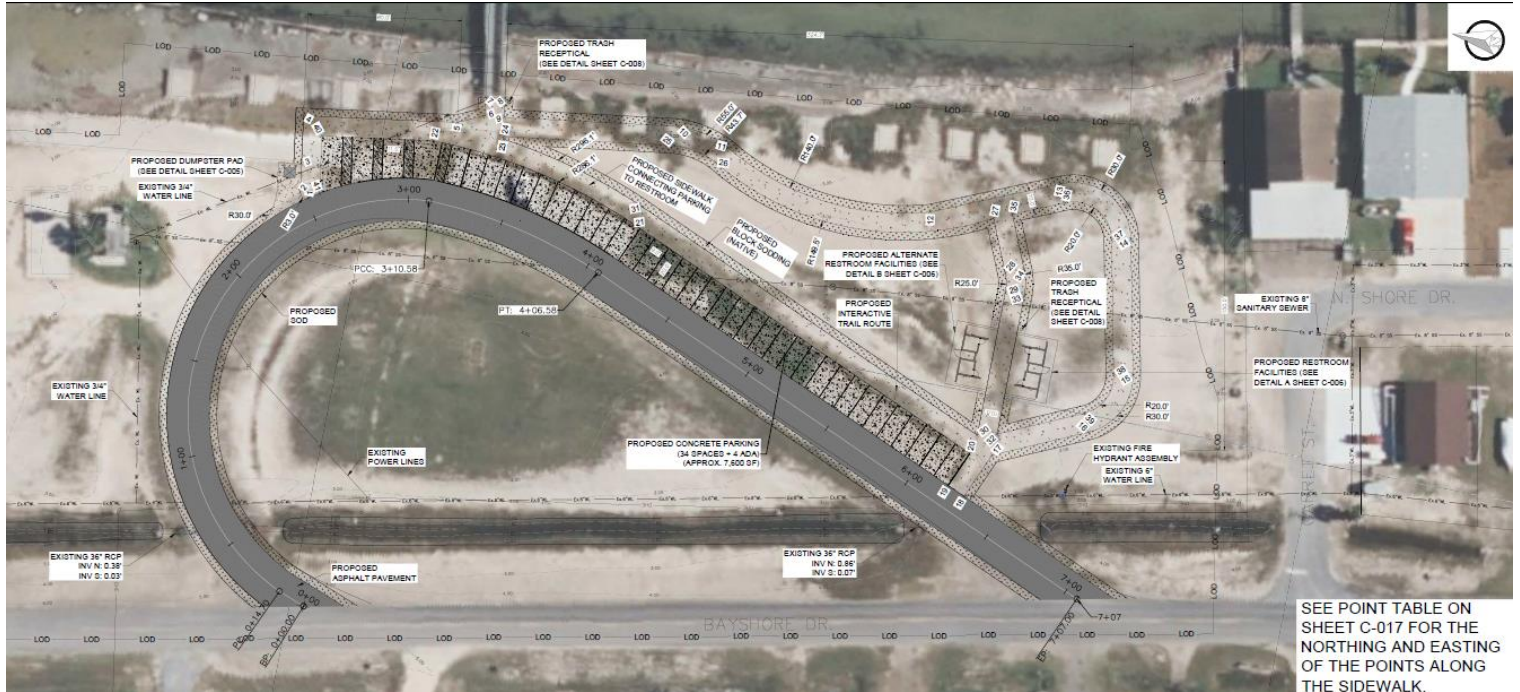
Detail from final plans submitted by Mott MacDonald

Mott MacDonald engineers were procured for the second design attempt and began work in May 2023. Mott MacDonald worked closely with the County to confirm structural and design elements for the restroom facility, parking, walking trails and other requested improvements. 30% plans were submitted in February 2024 and final plans submitted early June 2024. Minimal GLO comments were received and final plans and construction bid documents were submitted by the engineers and approved by the County.