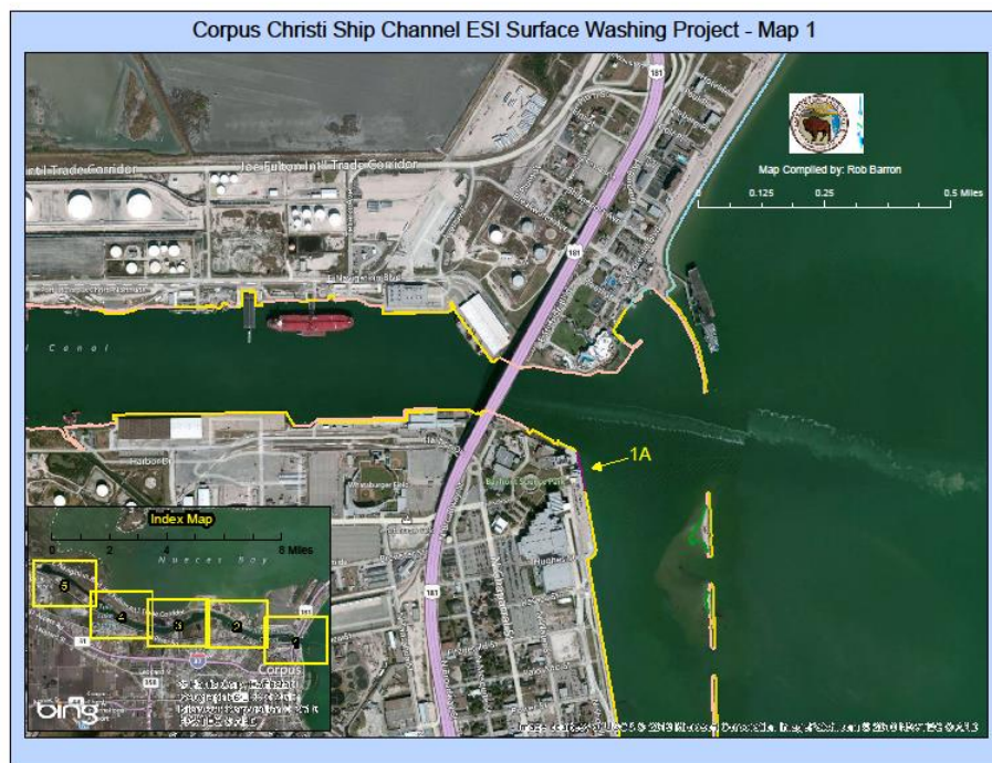
Figure 2 Note Index Map at lower left, indicating corresponding divisions of the Corpus Christi Inner Harbor, providing a more detailed view of the identified segment “1.”