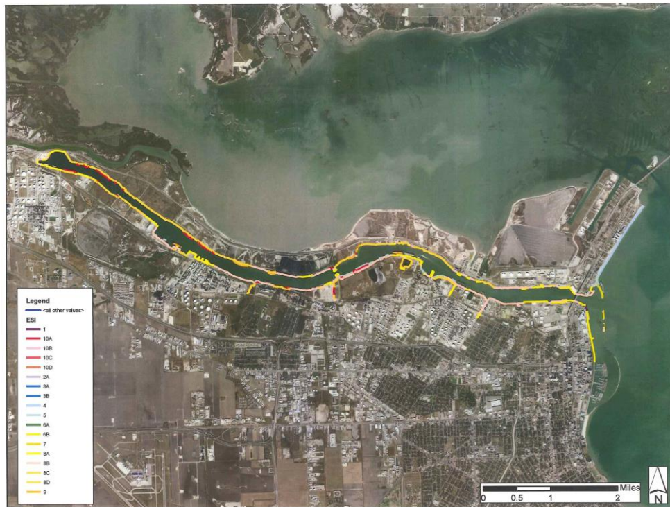
Figure 1 A full overview of the proposed Corpus Christi Inner Harbor Preauthorized Area for surface washing use.