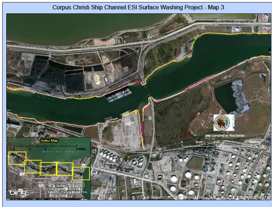
Figure 4 Note Index Map at lower left, indicating corresponding divisions of the Corpus Christi Inner Harbor, providing a more detailed view of the identified segment “3”