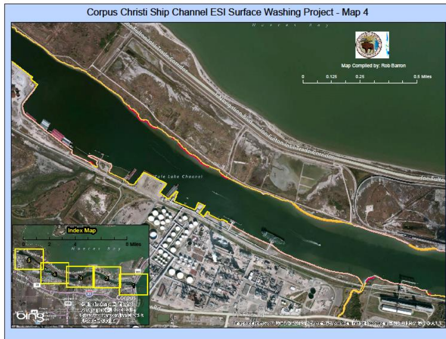
Figure 5 Note Index Map at lower left, indicating corresponding divisions of the Corpus Christi Inner Harbor, providing a more detailed view of the identified segment “4.”