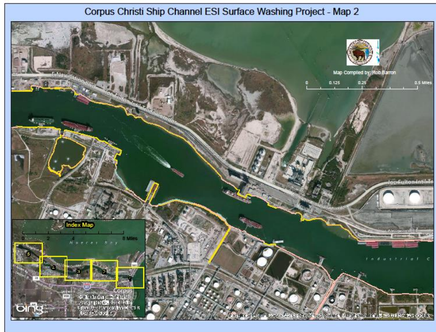
Figure 3 Note Index Map at lower left, indicating corresponding divisions of the Corpus Christi Inner Harbor, providing a more detailed view of the identified segment “2.”