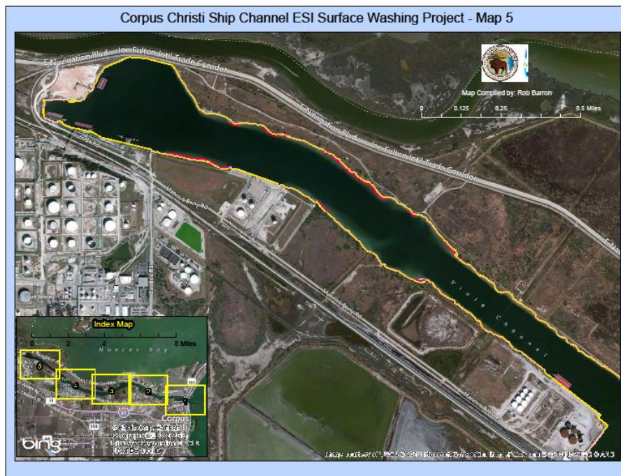
Figure 6 Note Index Map at lower left, indicating corresponding divisions of the Corpus Christi Inner Harbor, providing a more detailed view of the identified segment “5.”