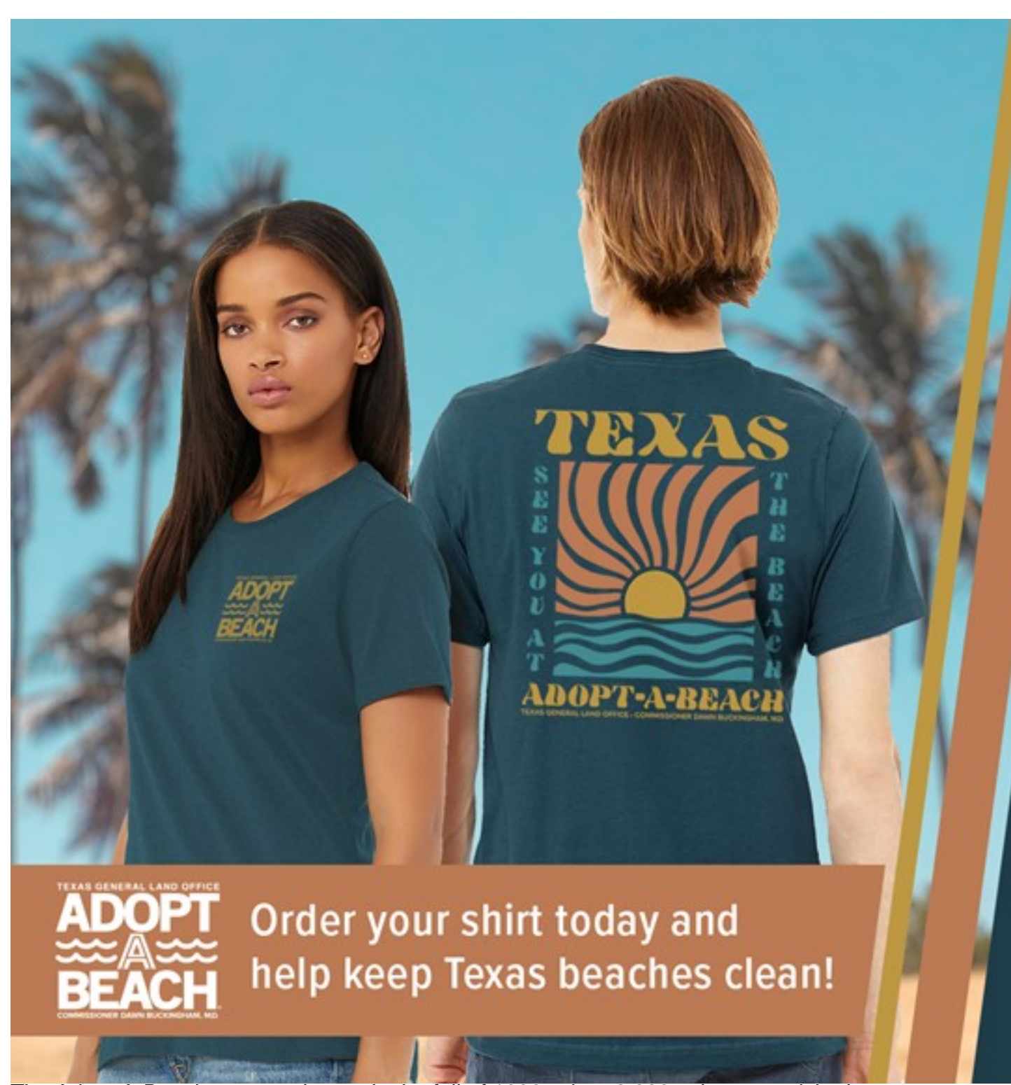
The Adopt-A-Beach program began in the fall of 1986, when 2,800 volunteers picked up 124 tons of trash. Since then, more than 563,363 Texas Adopt-A-Beach volunteers have picked up nearly 10,000 tons of trash from Texas beaches.