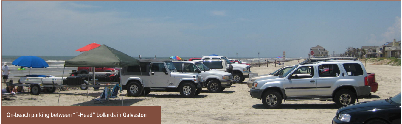
On-beach parking between “T-Head” bollards in Galveston