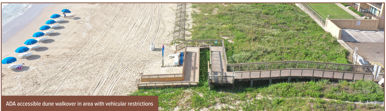
ADA accessible dune walkover in area with vehicular restrictions