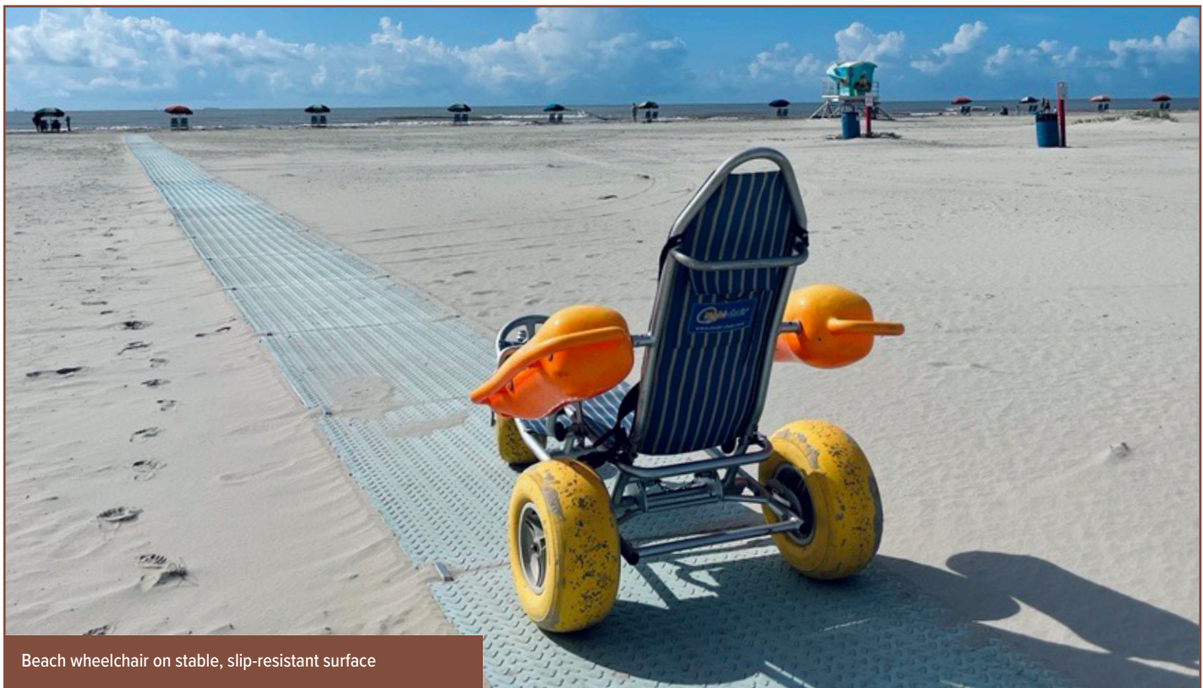
Beach wheelchair on stable, slip-resistant surface

In each jurisdiction where vehicles are prohibited from driving to mean high tide, at least one access way with a stable, slip-resistant surface must be provided to the approximate high tide line, and signs identifying the accessible beach access route must be conspicuously posted. Under GLO rules, an alternate means of access for persons with disabilities, such as beach wheelchairs, may be provided in areas where the local government demonstrates that providing and maintaining a stable, slip-resistant surface to the approximate high tide line is not practicable. While this standard meets the requirements in GLO rules, it may require a variance from the TDLR requirements.