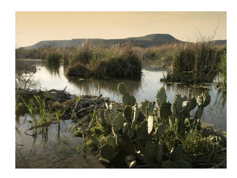
STATE AGENCY PROPERTY