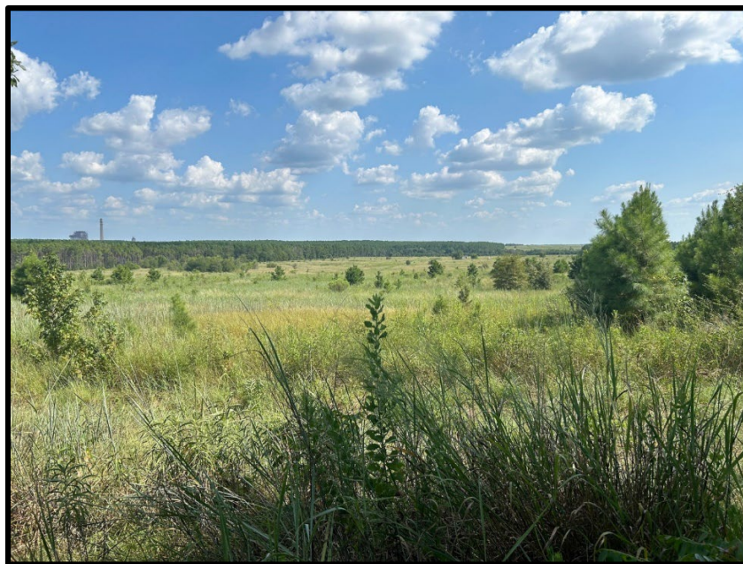
64 Acre – Blankenship Survey, Abstract 71