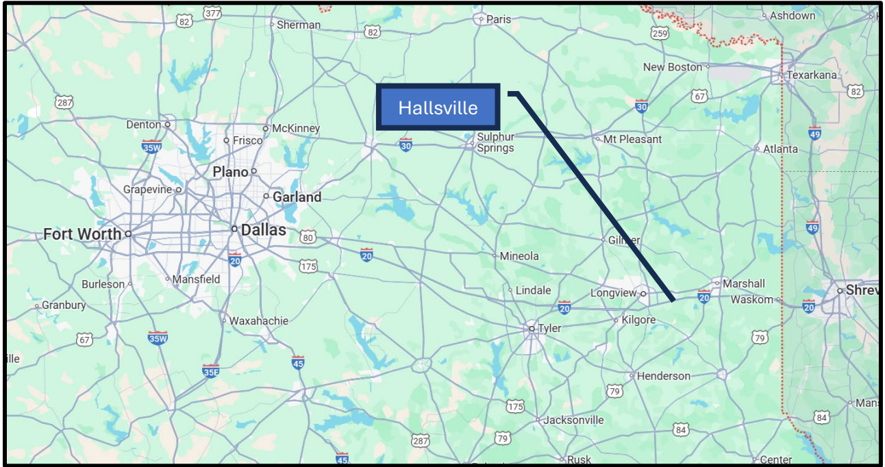
Map 1: Hallsville in relation to Dallas/Fort Worth Metro Area

The 64-acre tract is in northeast Texas in Hallsville, approximately 12 miles southeast of Longview. Map 1 indicates the location of Hallsville in relation to the Dallas metro area. Map 2 shows the local area.