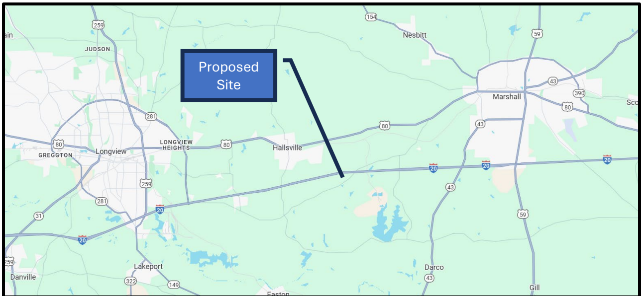
Map 2: Area detail map.