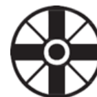
(24) THE CHURCH OF WORLD MESSIANITY