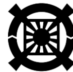
(56) UNIFICATION CHURCH