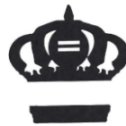
(78) KINGIAN FAITH