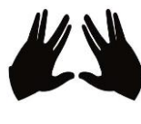
(45) KOHEN HANDS