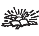
(67) POLISH NATIONAL CATHOLIC CHURCH