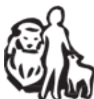
(20) COMMUNITY OF CHRIST