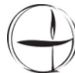
(8) UNITARIAN (FLAMING CHALICE)