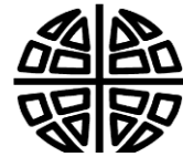
(72) EVANGELICAL LUTHERAN CHURCH