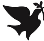
(77) DOVE OF PEACE