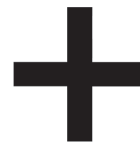
(14) GREEK CROSS