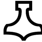
(55) HAMMER OF THOR