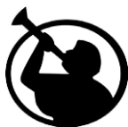
(11) THE CHURCH OF JESUS CHRIST OF LATTER-DAY SAINTS (ANGEL MORONI)