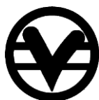
(25) UNITED CHURCH OF RELIGIOUS SCIENCE