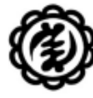
(63) AFRICAN ANCESTRAL TRADITIONALIST