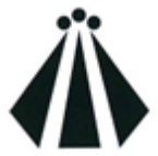
(65) DRUID (AWEN)