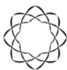
(35) SOKA GAKKAI INTERNATIONAL (USA)