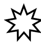
(15) BAHAI (9-POINTED STAR)