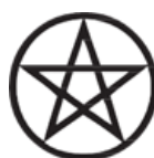
(37) WICCA (PENTACLE)