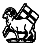
(27) UNITED MORAVIAN CHURCH