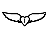
(21) SUFISM REORIENTED