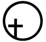
(73) UNIVERSALIST CROSS