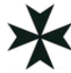
(64) MALTESE CROSS