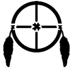
(53) FOUR DIRECTIONS