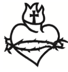
(62) SACRED HEART