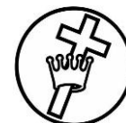
(47) FIRST CHURCH OF CHRIST, SCIENTIST (CROSS & CROWN)